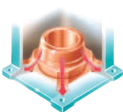
Smooth and direct transition of forces to the mounting feet.

As a component of the mixer design, the gear unit performs several functions. In addition to reducing speed and increase torque, it must also provide support for mixer shaft and impeller and the associated mixer forces. This means that the gear unit cannot be selected on the basis of the output torque alone. Bearing loads and shaft deflections resulting from the mixer action are in addition to those already present from the torsional loads. Gear housing design, low speed shaft and bearings are therefore rated to carry large bending moments and thrust loads imposed by the mixing forces. Different executions for mounting and centring of the drive group on the mixer tank are possible.