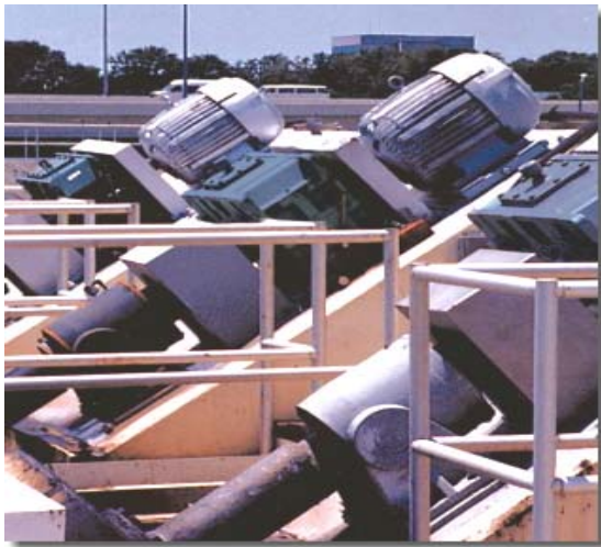
Water Treatment Applications